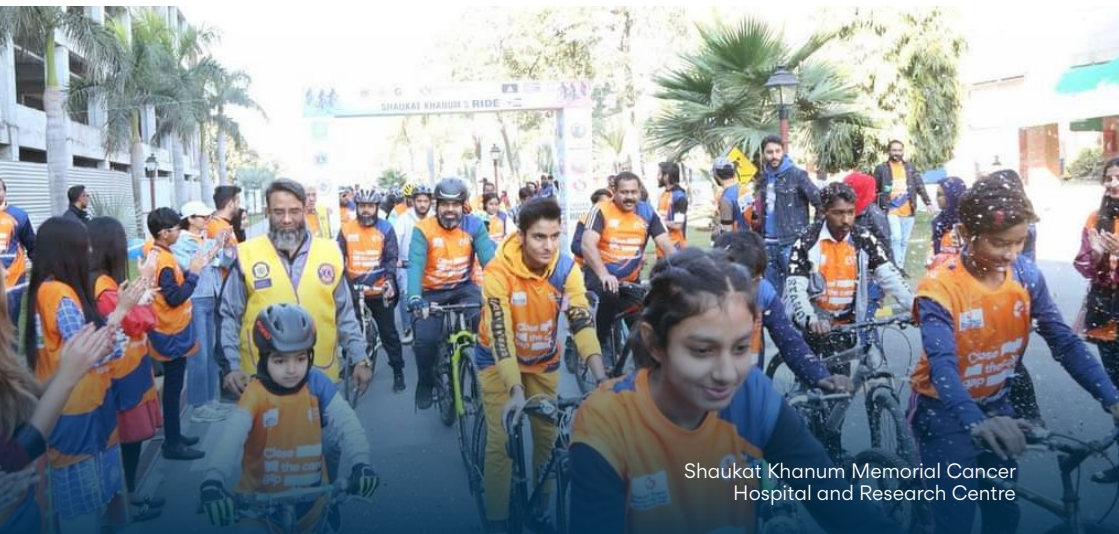
Shaukat Khanum Memorial Cancer Hospital and Research Centre